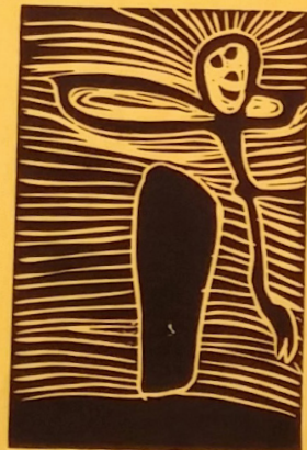
Surfs up by Jake