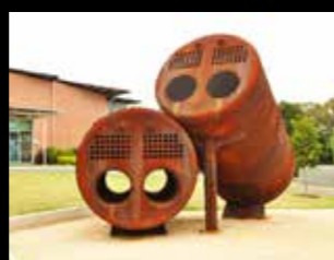
Philip Spark Turbulent Flow Steel, brass & silver 2011 Commissioned in 2011